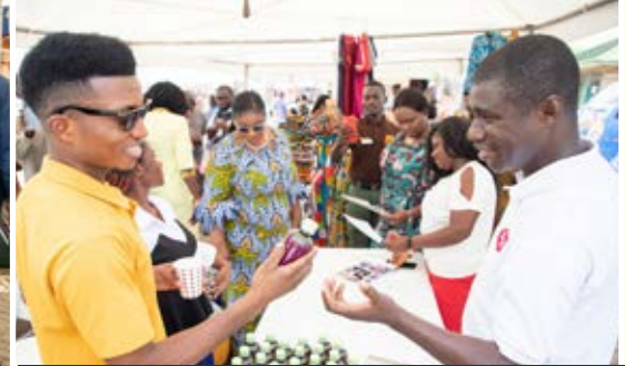
Kofi Kinaata Interacting with "Tuesday Market" vendors