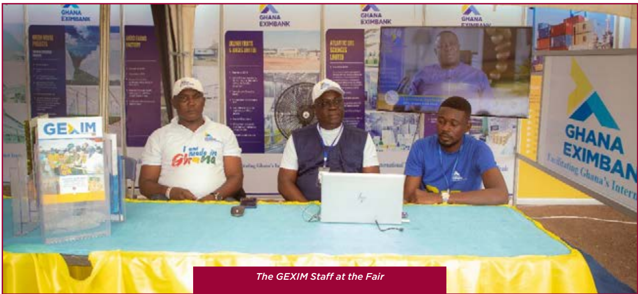
The GEXIM Staff at the Fair

Hinged on wooing investment to the Region, the Expo on the theme: "Promoting Trade, Tourism, and Investments in the Central region: Challenges, Prospects, and Solutions," sought to showcase the investment potential of the region.