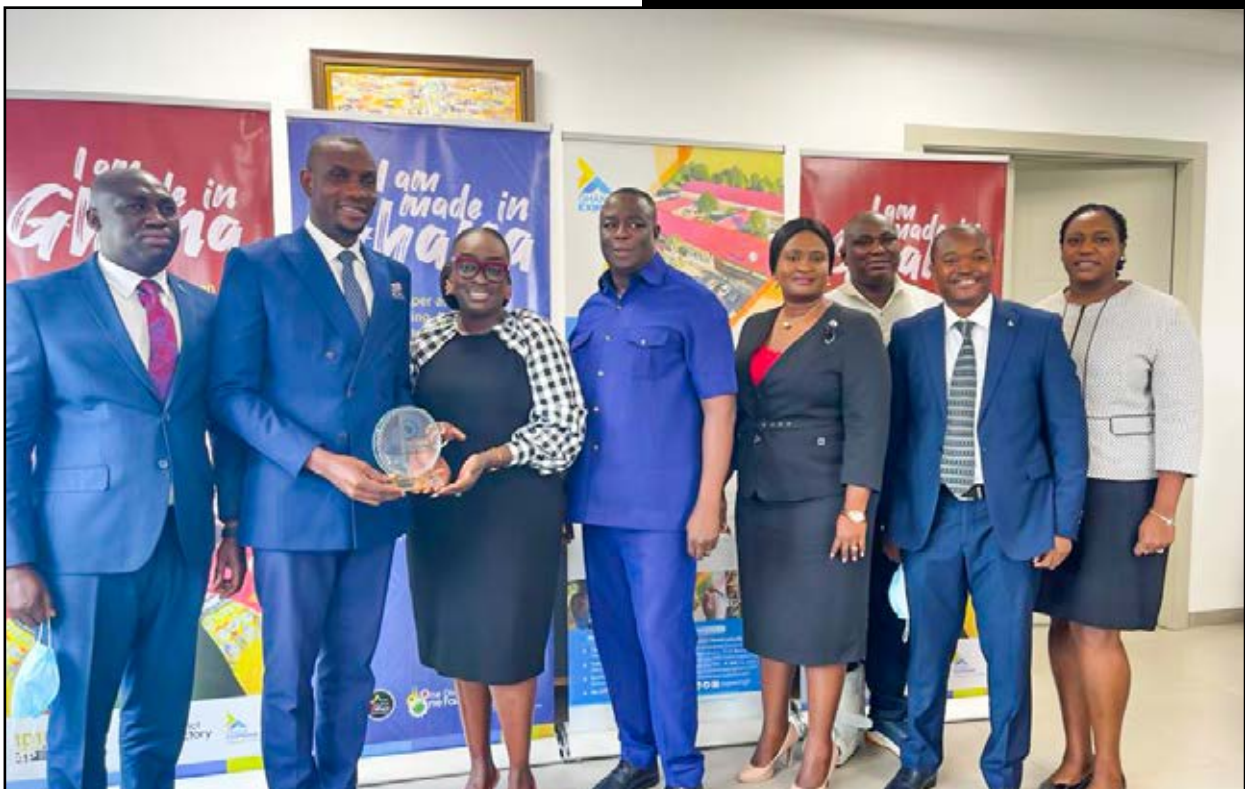
Management Team of GEXIM with the Award after the Presentation