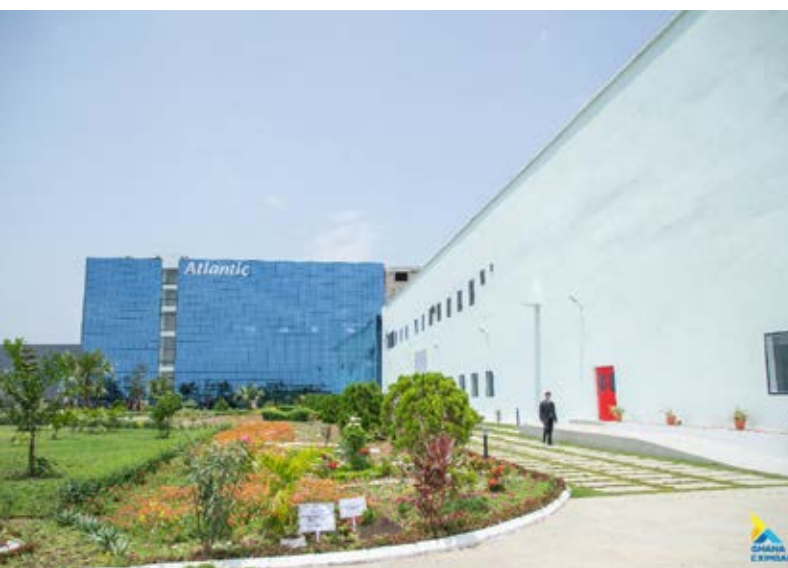
Front view of the factory

Additional 400 personnel will be recruited when the company starts full operations and the entire project is completed.