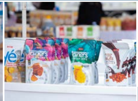
Some Made-in-Ghana Products on display at the "Tuesday Market".

G EXIM relaunch its popular SME "Tuesday Market" on Tuesday, April 26, 2022, at the World Trade Centre in Accra. The Event witnessed an exhibition of Made-In-Ghana products from 10 am. to 6 pm.