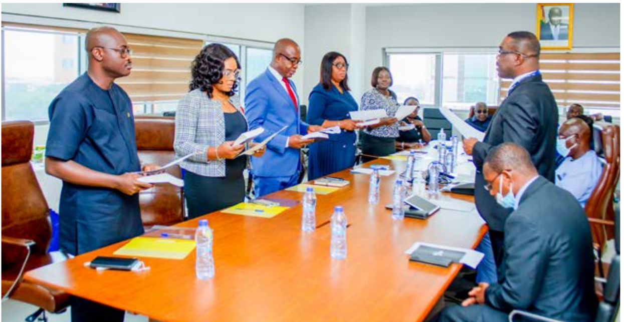
Swearing-In of new members