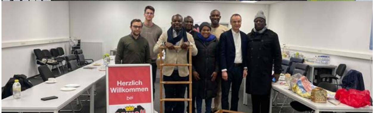
GEXIM team at the Exhibition in Germany