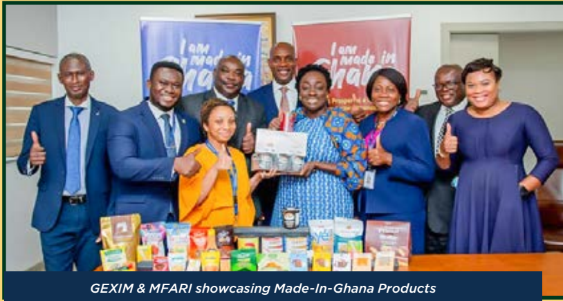
GEXIM & MFARI showcasing Made-In-Ghana Products

As part of its mandate to finance and develop strategic import substitute products to support the reduction of Ghana's import bill, Ghana Exim Bank (GEXIM) is collaborating with the Ministry of Foreign Affairs and Regional Integration to champion the Country's industrialization agenda.