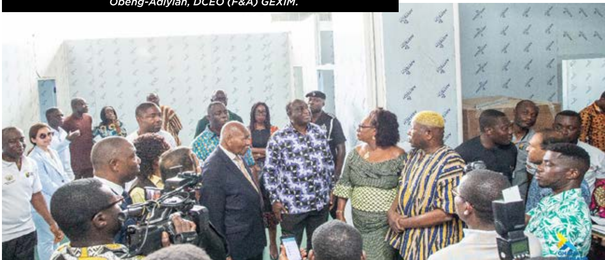
Hon. Alan Kyerematen, Minister of Trade and Industry, and Mr. Sam Okudzeto, a member of the Council of State toured the factory after the commissioning.

Present at the commissioning were Hon. Alan Kyeremanten, the then Minister of Trade and Industry, Mr. Sam Okudzeto, member of the Council of State, Ministers of State, Members of Parliament, Traditional Rulers, amongst other dignitaries.