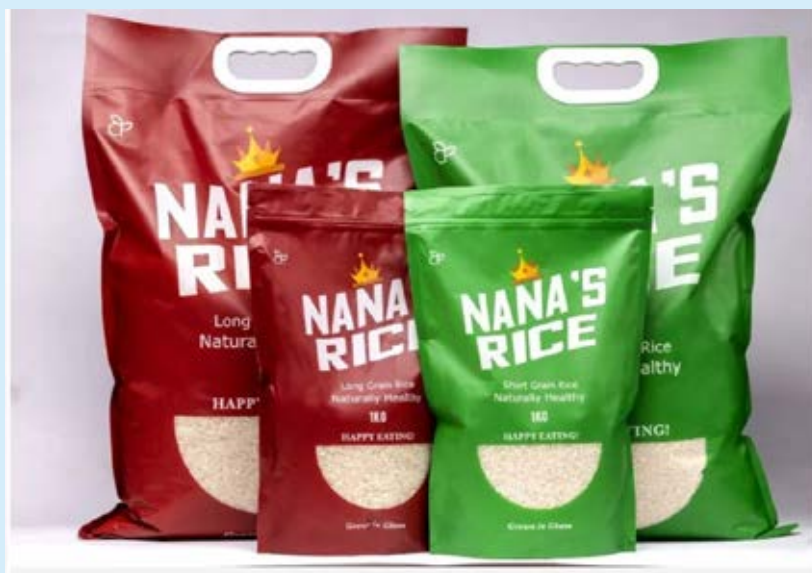
Nana rice, a locally produced rice