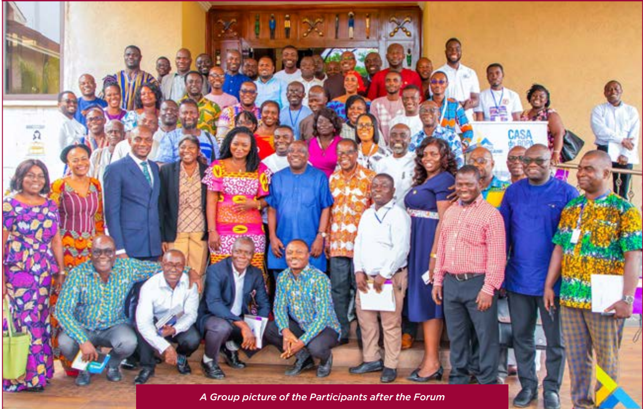
A Group picture of the Participants after the Forum